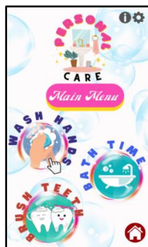
Figure 2: Activities cues