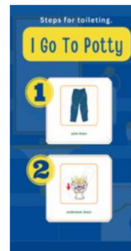
Figure 3: Toileting practices

With embedded features within the mobile application, it helps teacher to communicate with the students as both of the parties are able to point to the cue and create a functional communication (Rocío Blanco et al., 2024). In the light of the foregoing, this studies focus is on evaluating the efficacy of Smart-App's usability in facilitating communication, personal care, and physical functioning, based on the embedded AAC features within and thereby contributing substantively to the discourse on assistive technologies in education. This is consistent with the findings of Ok and Rao (2019), who demonstrate that AT which reinforces skills and routines can be beneficial for students with impairments in learning.