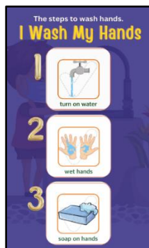
Figure 1: Example of steps-by-steps attainable procedures